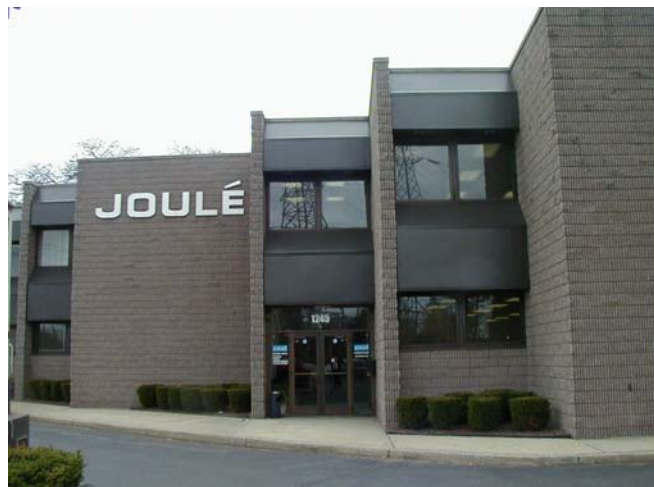
1245 Rt 1, Edison, NJ