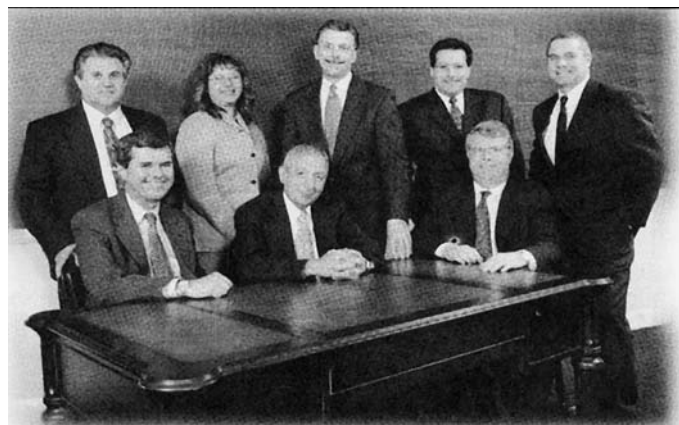
Joulé's Senior Management Team