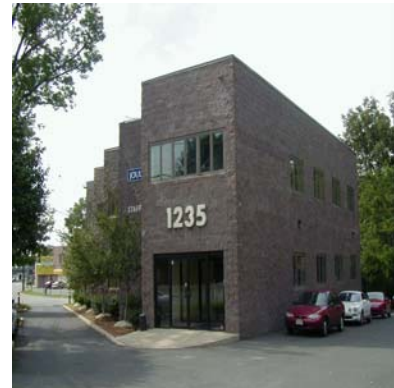
AFTER: 1235 Rt 1, Edison NJ

By 1993, Joulé had grown so large that a new 7,000 square foot building was required to house Joulé's Technical Engineering and Staffing Services divisions. As a result Joulé built the building that is now located at 1235 Route 1, Edison, New Jersey.