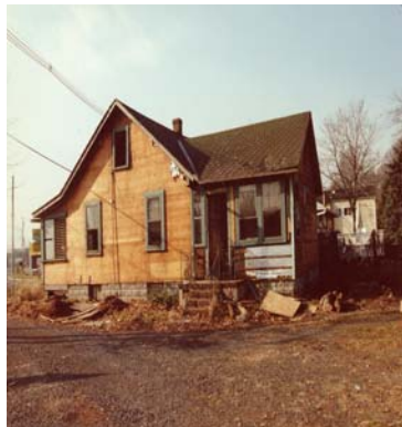
BEFORE: 1235 Rt 1, Edison NJ